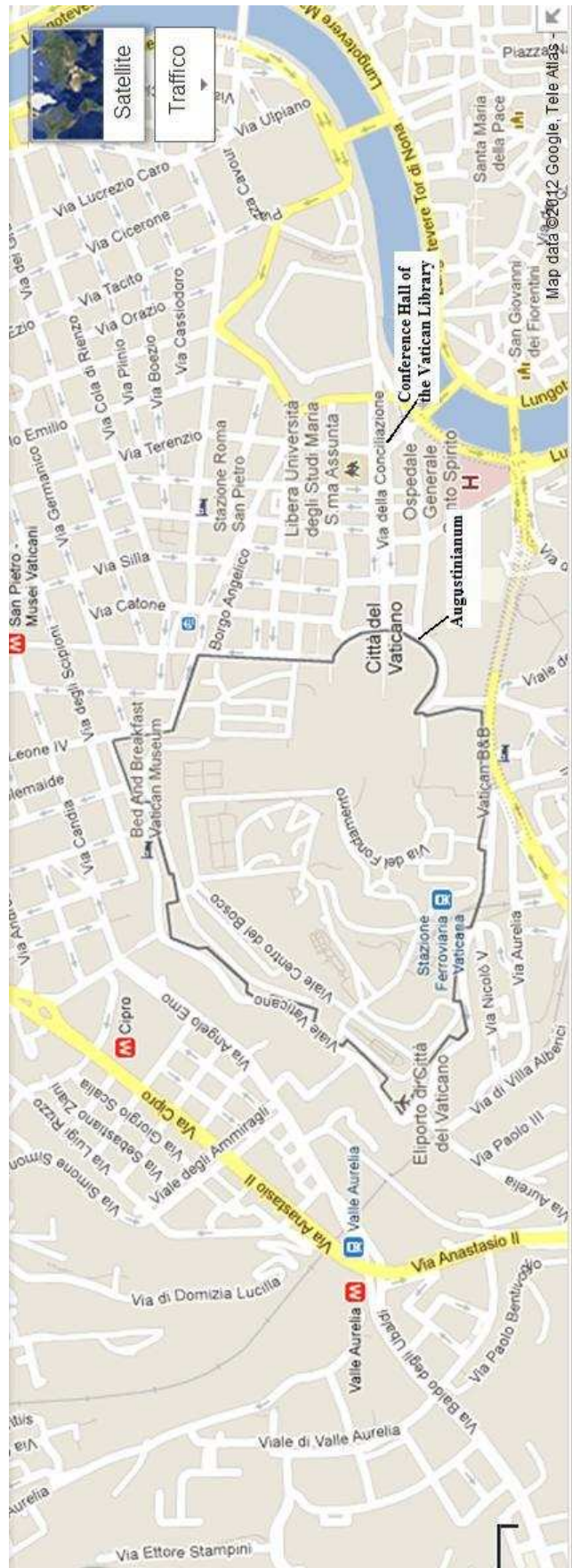
Map of the area of Saint Peter's Basilica