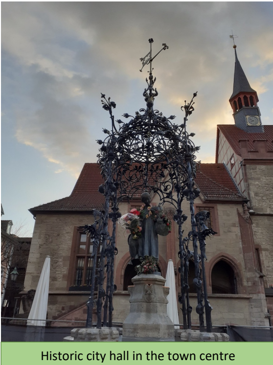
Historic city hall in the town centre

The aim of the conference is to be as sustainable as possible. Various measures are planned to avoid general and food waste as much as possible, including: